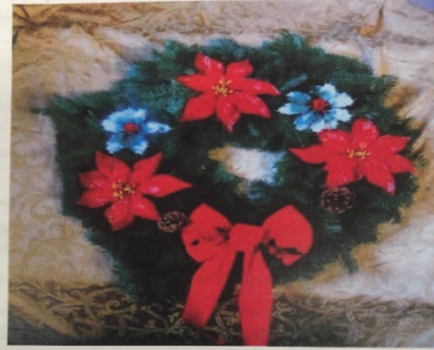
Option B. – Christmas Wreath (24" diameter)