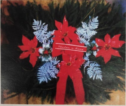
Option A. – Christmas Pillow (24" X 36")