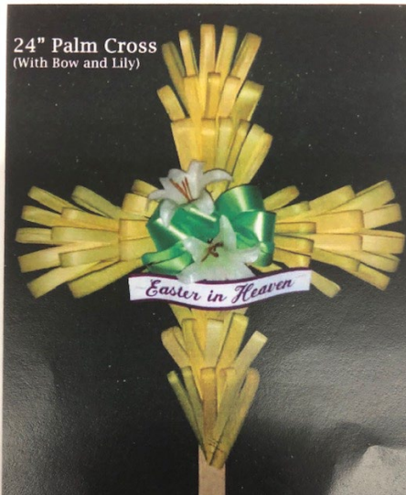
24" Palm Cross (With Bow and Lily)